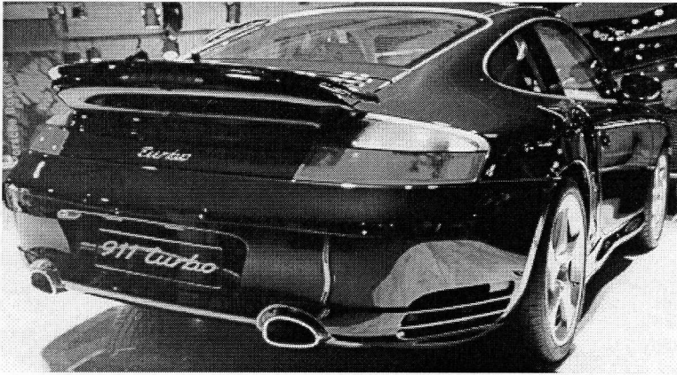
Germany Auto Show